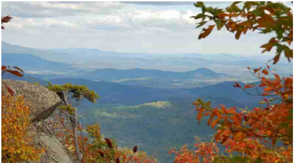
Figure 1. An example image.